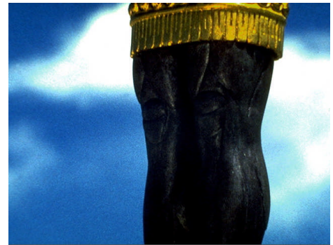
The Iron Legs of Rome.

And as the toes of the feet were partly of iron and partly of clay, so THE KINGDOM SHALL BE PARTLY STRONG AND PARTLY FRAGILE. As you saw iron mixed with ceramic clay, they will MINGLE WITH THE SEED OF MEN; BUT THEY WILL NOT ADHERE TO ONE ANOTHER, just as iron does not mix with clay.