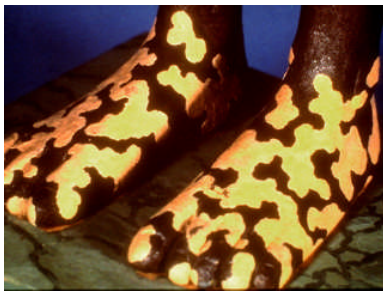
The Ten Toes of Europe.