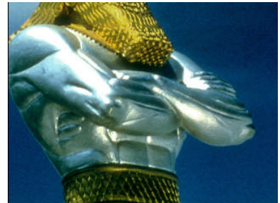
The Silver Chest of Medo-Persia.

But after you shall arise ANOTHER KINGDOM inferior to yours; then ANOTHER, A THIRD KINGDOM OF BRONZE, which shall rule over all the earth.