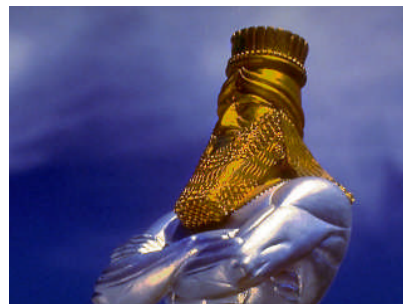
The Golden Head of Babylon.

That you will take up this proverb against the king of Babylon, and say: "How the oppressor has ceased, THE GOLDEN CITY CEASED!"