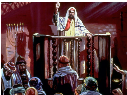
Paul commended the Bereans for searching the Bible every day.

Acts 17:11 These were more fair-minded than those in Thessalonica, in that they received the word with all readiness, and SEARCHED THE SCRIPTURES DAILY to find out whether these things were so.