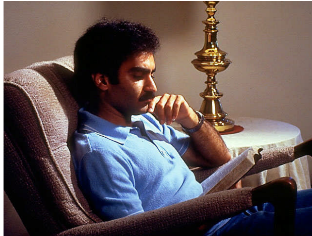
Daily Bible study is important for spiritual development.

God has done so much for us in giving us the Bible, but He also gave us His Son to die on Calvary. Today He is asking for your life, that He might save it for eternity. Friend, read His Word and you will know how to live a life of victory through Christ.