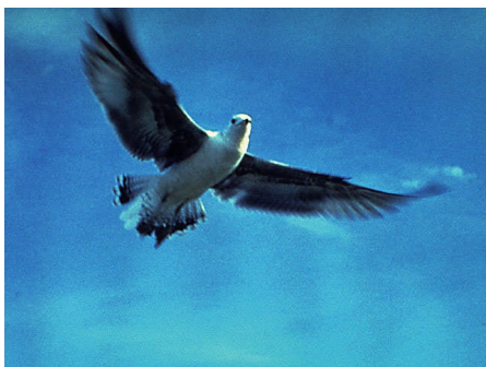
We need the guidance of the Holy Spirit to understand the Bible.

Matthew 7:21 Not everyone who says to Me, 'Lord, Lord,' shall enter the kingdom of heaven, but he who DOES THE WILL OF MY FATHER in heaven.