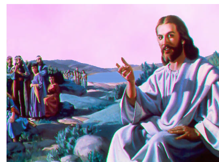
Jesus taught that there was Devil who was the author of sin.

Ezekiel 28:12-15 Son of man, take up a lamentation for the king of Tyre, and say to him, "Thus says the Lord GOD: you were the seal of perfection, full of wisdom and perfect in beauty. You were in Eden, the garden of God; every precious stone was your covering: the sardius, topaz, and diamond, beryl, onyx, and jasper, sapphire, turquoise, and emerald with gold. The workmanship of your timbrels and pipes was prepared for you on the day you were created. You were the anointed cherub who covers; I established you; you were on the holy mountain of God; you walked back and forth in the midst of fiery stones. You were perfect in your ways from the day you were created, till iniquity was found in you."