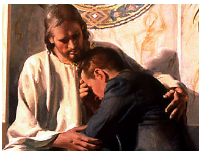
Jesus loves us and will defeat His and our enemy – Satan.

To reverse the procedure would bring defeat. We have nothing to fear while we constantly surrender our lives to Jesus Christ. We need never fear the devil – in fact it is better to think of Jesus.