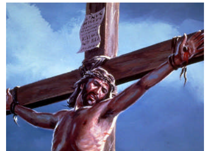
The death of Christ made sure the death of sin and suffering.

John 3:16 For God so loved the world that He gave His only begotten Son, that whoever believes in Him should not perish but have everlasting life.