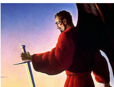
The Devil is like a roaring lion seeking to devour us.

GOD WILL YET DO SOMETHING ABOUT SUFFERING. Those who accept the gospel are given the reward of living in God’s eternal kingdom where sin and suffering will never arise. Soon Satan, sin, sinners and suffering will be gone. The wickedness of sin will have filled its cup of iniquity and will prove beyond doubt to the whole universe that sin and its government must be shunned for eternity. Even Satan will be destroyed. His outcome is eternal death. The lake of fire will bring about his destruction. He will be tormented (i.e. to try, or test) for eternity. Torment does not mean torture. His trial in the fire will result in his eternal end.