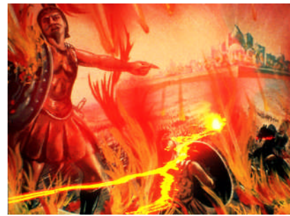
Satan and his followers will be destroyed at the end of the millennium.

2 Corinthians 11:13-15 For such are false apostles, deceitful workers, transforming themselves into apostles of Christ. And no wonder! For Satan himself transforms himself into an angel of light. Therefore it is no great thing if his ministers also transform themselves into ministers of righteousness, whose end will be according to their works.