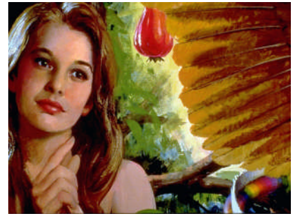
Eve believes the lies of Satan against God and takes the fruit of the tree of knowledge of good and evil.

Revelation 12:4,7,9 His tail drew a third of the stars of heaven and threw them to the earth. And the dragon stood before the woman who was ready to give birth, to devour her Child as soon as it was born....And war broke out in heaven: Michael and his angels fought with the dragon; and the dragon and his angels fought,... So the great dragon was cast out, that serpent of old, called the Devil and Satan, who deceives the whole world; he was cast to the earth, and his angels were cast out with him.