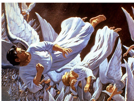
Lucifer and his sympathisers were removed from heaven.

Lucifer was cast out of heaven because of a long succession of selfish choices. He came to live in one narrow dimension: “I”. This is how Lucifer, the Archangel, perfect and sinless, debased himself into Satan, the devil. So selfish had he become that he aspired to take God’s position of rulership. He wanted God’s power, but not His character of love.