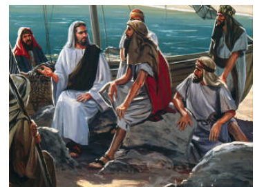
Jesus teaching about Hell.

Jeremiah 17:27 But if you will not heed Me to hallow the Sabbath day, such as not carrying a burden when entering the gates of Jerusalem on the Sabbath day, then I will kindle a fire in its gates, and it shall devour the palaces of Jerusalem, and it shall not be quenched.