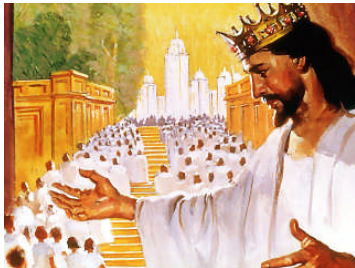
Jesus welcomes saints into heaven.

2 Peter 3:9 The Lord is not slack concerning His promise, as some count slackness, but is longsuffering toward us, not willing that any should perish but that all should come to repentance.