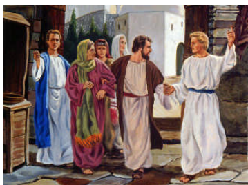
Lot and family escorted out of Sodom.

Sodom and Gomorrah were destroyed by fire many thousands of years ago, yet this text calls the fires of destruction 'eternal fire'. Are these fires burning today? Of course not. Everlasting fire simply means that the fire is eternal in its effects. The everlasting fire at the end of time will destroy the wicked for all time, just as Sodom and Gomorrah were annihilated with never a hope of recovery.