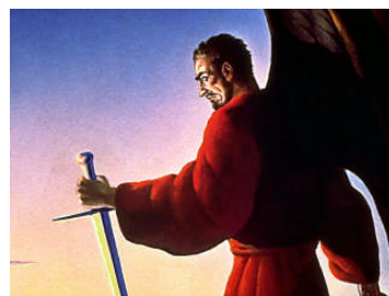
Satan will be burnt to ashes.

Ezekiel 28:18,19 Thou hast defiled thy sanctuaries by the multitude of thine iniquities, by the iniquity of thy traffick; therefore will I bring forth A FIRE FROM THE MIDST OF THEE, it shall devour thee, and I WILL BRING THEE TO ASHES upon the earth in the sight of all them that behold thee. All they that know thee among the people shall be astonished at thee; thou shalt be a terror and NEVER SHALT THOU BE ANYMORE. (KJV)