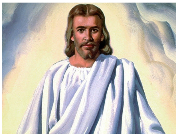
Those who love Jesus will keep His commandments.

The test of love is obedience. Friend, do you love Jesus enough to obey Him? Remember, He loved you enough to die for you. His plea to you today is to keep His commandments. They are not grievous – in fact to keep them, will keep you out of trouble in this life, and bring you happiness. God's way of willing obedience is the best way, and if Jesus is supreme in your life, He will give you the strength to keep the commandments of God.