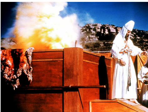
The sacrificial ceremonies were fulfilled at the cross and blotted out.

HAVING WIPED OUT THE HANDWRITING OF REQUIREMENTS that was against us, which was contrary to us. And He has taken it out of the way, HAVING NAILED IT TO THE CROSS . Having disarmed principalities and powers, He made a public spectacle of them, triumphing over them in it. So let no one judge you in FOOD or in DRINK , or regarding a FESTIVAL or a new moon or sabbaths, which are a shadow of things to come, but the substance is of Christ.