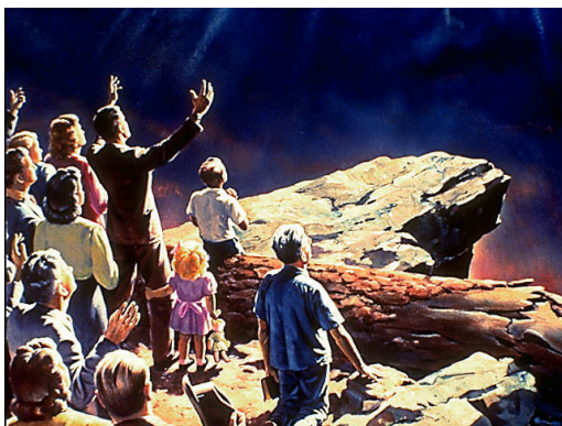
Revelation 14 says that God’s people in the last days will keep God’s commandments.

The works of His hands are verity and justice; all His precepts are sure. THEY STAND FAST FOREVER AND EVER, and are done in truth and uprightness.