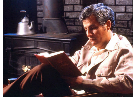
God will write His law on our hearts.

Hebrews 5:9 And having been perfected, He became the author of eternal salvation TO ALL WHO OBEY HIM,