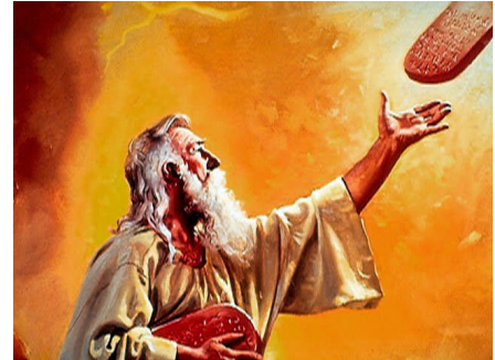
Moses receiving the Ten Commandments.

Paul is emphatic. There is nothing wrong with the law. In fact he says that he would not be conscious of sin without the law to show him his errors. Here he quotes from the 10th commandment. The commandments can be likened to a mirror. If a boy with a dirty face looks in the mirror, then the mirror tells him his face is dirty – but it won't clean it for him, he needs soap and water. As we look at the commandments they show us our sins, but they do not cleanse us. We need the blood of Christ to make us clean. When we are cleansed and look into the commandments, they no longer condemn us.