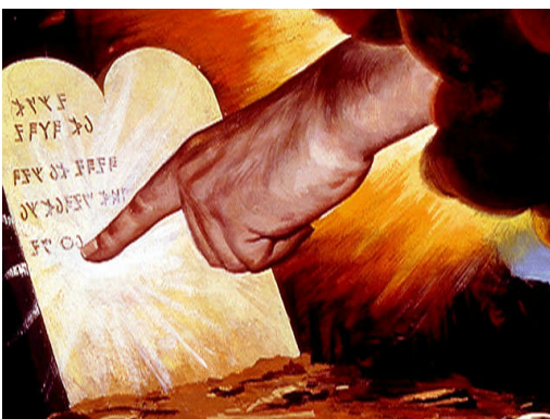
The Ten Commandments were written with God’s own finger. The only part of the Bible written directly by God!

Exodus 31:18 And when He had made an end of speaking with him on Mount Sinai, He gave Moses two tablets of the Testimony, TABLETS OF STONE, WRITTEN WITH THE FINGER OF GOD.