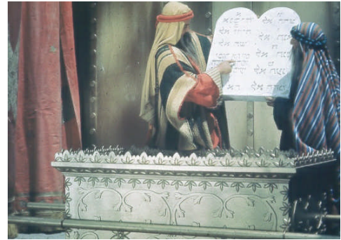
The Ten Commandments were placed in the Ark.

The first four deal with our love to God, and the last six deal with our love for our fellowman. They can be divided into these two sections. There is one underlying principle behind these commands – LOVE. In these commands we see a transcript of God’s character: “God is love”. At first they may appear to be a list of “don’ts, but when a Christian is motivated by love, he wants to please God and respect his fellow humans.