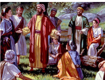
Christians met by a riverside on Sabbath when no synagogue was available.

And from there to Philippi, which is the foremost city of that part of Macedonia, a colony. And we were staying in that city for some days. And ON THE SABBATH day we went out of the city to the riverside, where prayer was customarily made; and we sat down and spoke to the women who met there .