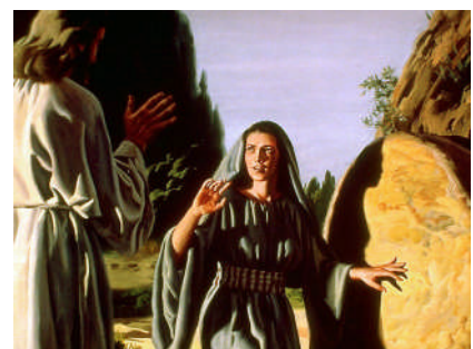
Jesus appears to Mary on the first day of the week.

The repetition continues through the gospels. Again, the book of Luke was written years after the resurrection. If any change had occurred, it would surely have been recorded, for this would have been a major issue in the mind of any Jew, even a Christian Jew: yet years after Christ ascended to heaven, the subject is met with silence. The reason is obvious – no change had occurred.