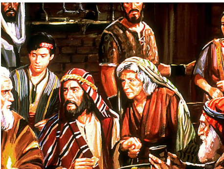
The disciples gathered on the first day of the week not for worship but for fear of the Jews.

John 20:19 Then, the same day at evening, being THE FIRST DAY of the week, when the doors were shut where the disciples were assembled, FOR FEAR OF THE JEWS, Jesus came and stood in the midst, and said to them, "Peace be with you."