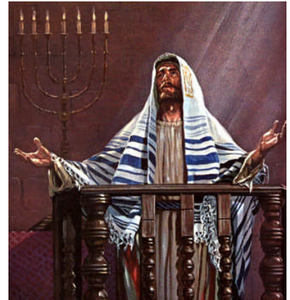
Paul preaching before leaving for Assos on Sunday.

Before Paul left Troas he gave a long sermon. He was leaving the next morning, so made the most of his time there. It was the first day of the week, and in Bible reckoning (sunset to sunset), the first day of the week commenced at sunset on Saturday night. He could have sailed that night, but chose to stay, then walk to Assos the next morning (Sunday) to catch his boat; a distance of nineteen and a half miles. He did not rest on Sunday, but regarded it as a normal day of the week. But notice that they broke bread on the first day. Many conclude that this makes the day holy, but observe the next text.