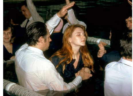
The rite of baptism is symbolic of the death, burial and resurrection of Jesus. We commemorate His resurrection by baptism not worship on Sunday.

By partaking of the symbols of bread and wine in the communion service, we are remembering Christ's death at Calvary. The bread reminds us of His broken body, and the wine of His shed blood to cover our sins. By this service we remember His death.