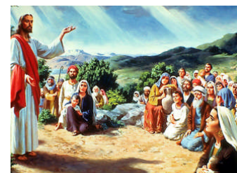
Jesus taught that it is unpardonable to speak against the Holy Spirit.

Here is the unpardonable sin – speaking against the Holy Spirit. There has been a great deal of speculation as to what the unpardonable sin actually is. Some have said it is murder; others say adultery or rape; but this cannot be. Notice Jesus said, “all manner of sin shall be forgiven” and this means any sin you would care to name. King David was forgiven for murder and adultery. Rahab was forgiven when she turned from her life of harlotry. Peter was forgiven for his denial of Christ. Mary Magdelene was forgiven for her licentious ways and Moses was forgiven for killing the Egyptian.