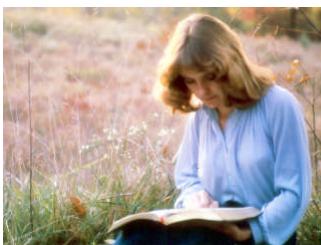
Walk in the light while you have it.

The person who has such a conscience is past feeling – past response to the conviction of the Holy Spirit. A seared conscience has no feeling, it is like a dead radio. Radio waves may be all around but the dead radio cannot detect them. Some minds have developed this way so that they can no longer hear the pleading voice of God. There is no desire to repent, no desire to follow truth. Such a person has indeed committed the unpardonable sin. The fact that a person is concerned shows that they are not guilty, for those who are guilty are in no way concerned. The one who is somewhat fearful gives evidence that he or she can feel the Holy Spirit convicting them: therefore they have not committed the unpardonable sin.