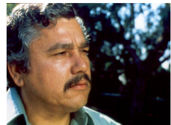
When the Spirit speaks to us we dare not resist.

A person may not obey God’s commandments because he or she has not yet come under conviction – only God has the right to judge each case, but on the other hand, there are many who will be lost who believed truth, but neglected to obey it. Then there are others like Felix who waited for a more convenient time, but Felix never called on Paul again – the more convenient time never came. How successful the devil has been in tempting souls to put off to a future time their acceptance of Christ.