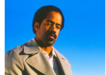
The more we resist, the weaker the Spirit's voice is to our minds.

Isaiah 30:21 YOUR EARS SHALL HEAR A WORD BEHIND YOU, SAYING, "THIS IS THE WAY, WALK IN IT," Whenever you turn to the right hand or whenever you turn to the left.