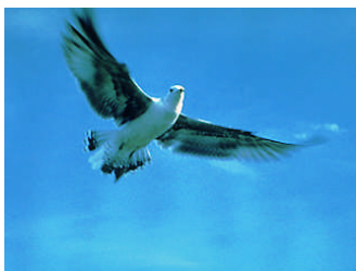
We can grieve the Holy Spirit by continual rejection of conscience.

John 16:13 However, when He, the Spirit of truth, has come, HE WILL GUIDE YOU INTO ALL TRUTH; for He will not speak on His own authority , but whatever He hears He will speak; and He will tell you things to come.