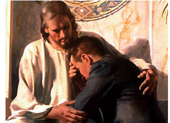
If we confess our sins – all is forgiven.

If all sin can be forgiven, what sin then becomes unpardonable? Grieving the Holy Spirit will lead to the unpardonable sin, for it is His work to guide us on the pathway to eternal life. Without His help we would be deprived of our Guide which we so desperately need.