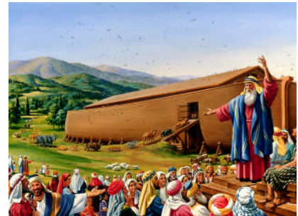
Noah demonstrated faith in God by obeying God's word. We also need faith.

Hebrews 11:6 BUT WITHOUT FAITH IT IS IMPOSSIBLE TO PLEASE HIM , for he who comes to God must believe that He is, and that He is a rewarder of those who diligently seek Him.