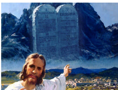
Obedience is essential for answered prayer.

If a person has been convicted to keep God's commandments, and refuses to listen, be it a great matter or small, God regards his prayer as an abomination. It is a mistake to think God will accept the prayers of a professed Christian, while willingly that person disobeys God's commandments.