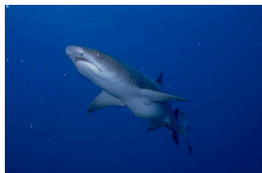
Sharks are unclean because they have no scales.

Of course it is not a sin to eat meat, but because God made humans to be vegetarian, this must be the diet God intended them to follow; therefore it appears the most healthy. Our teeth and digestive system parallel herbivorous animals. Some feel that one would suffer bad health if meat was eliminated from the diet, but the opposite is more likely to be true. Meat contains many waste substances which the body must deal with in the digestive process. Also in our world today meat is often diseased, which makes eating it a health risk. There are a number of animal diseases which can be transmitted to man. According to some nutritionists, a lacto (milk and milk products) ovo (eggs) vegetarian diet is nutritionally sound. Other nutritionists have found a vegetarian diet without milk and eggs is even better. Individuals must make their own choice. Modern science has discovered that a plant diet can eliminate many degenerative diseases. On average vegetarians are known to live longer than those who choose a flesh diet.