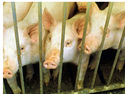
Pigs are unclean animals.

Deuteronomy 14:3-8 You shall not eat any detestable thing. THESE ARE THE ANIMALS WHICH YOU MAY EAT: the ox, the sheep, the goat, the deer, the gazelle, the roe deer, the wild goat, the mountain goat, the antelope, and the mountain sheep. And you may eat every animal with cloven hooves, having the hoof split into two parts, and that chews the cud, among the animals. NEVERTHELESS , of those that chew the cud or have cloven hooves, YOU SHALL NOT EAT, SUCH AS THESE: the camel, the hare, and the rock hyrax; for they chew the cud but do not have cloven hooves; they are unclean for you.