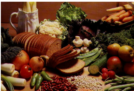
Fruits, vegetables, grains and nuts form the basis of the best diet.

1 Timothy 5:23 No longer drink only water, but USE A LITTLE WINE for your stomach's sake and your frequent infirmities.