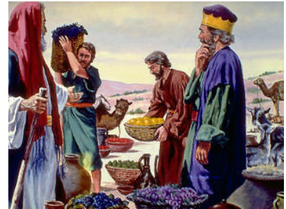
Abraham bringing tithes to the King of Salem.

Genesis 14:18-20 Then Melchizedek king of Salem brought out bread and wine; he was the priest of God Most High. And he blessed him and said: “Blessed be Abram of God Most High, possessor of heaven and earth; and blessed be God Most High, who has delivered your enemies into your hand.” And HE GAVE HIM A TITHE OF ALL.