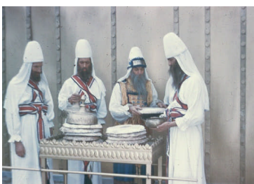
Tithe was used to support the priests attending to the Sanctuary service.

Numbers 18:20,21 Then the LORD said to Aaron: “You shall have no inheritance in their land, nor shall you have any portion among them; I am your portion and your inheritance among the children of Israel. Behold, I HAVE GIVEN THE CHILDREN OF LEVI ALL THE TITHES in Israel as an inheritance IN RETURN FOR THE WORK WHICH THEY PERFORM, THE WORK OF THE TABERNACLE of meeting.”