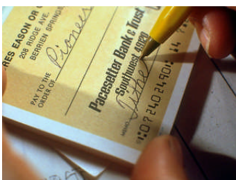
When we are faithful to God – God is faithful to us.

Proverbs 3:9,10 Honour the LORD with your possessions, and with THE FIRSTFRUITS OF ALL YOUR INCREASE; so your barns will be filled with plenty, and your vats will overflow with new wine.