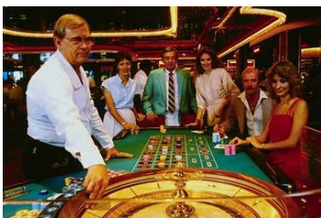
Gambling is breaking to 10 th commandment.

Exodus 20:17 YOU SHALL NOT COVET your neighbour's house; you shall not covet your neighbour's wife, nor his male servant, nor his female servant, nor his ox, nor his donkey, nor anything that is your neighbour's.