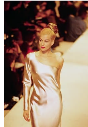
Seeking after fashion is conforming to the world.

1 Peter 2:9 But you are a chosen generation, a royal priesthood, a holy nation, HIS OWN SPECIAL PEOPLE , that you may proclaim the praises of Him who called you out of darkness into His marvelous light.