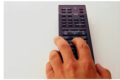
At the push of a button, anyone can access volumes of sex, violence and immorality – all fatal to spiritual growth.

Films that sell the most tickets are based on sex, violence and horror. This is directly opposed to Bible standards. The stars are, so often, immoral people, who are looked upon as role models. Movies can make crime attractive, glorify violence, and endorse drinking, smoking, gambling and immorality. Granted, there are some good things in movies, but often the good is so contaminated and mixed with evil. Bible films are not all they appear. In many cases they are Satan's subtle weapons to deceive the cautious Christian. Hollywood Bible films often twist the facts and tell a story unknown to the Bible account.