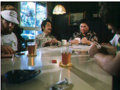
As Christians we make a determined effort with Christ's grace to resist worldly habits.

side of God's will. Then in His strength we succeed. In other words, we are constantly maintaining our faith in Him. Jesus advises us to "strive" to enter, and this we must do. Don't be mistaken, we are not victorious because we are striving to overcome evil in our own strength, this would be righteousness by works; rather, we are striving against our sinful human natures. We are always confronted with the choice of following our sinful nature, or our spiritual nature. It is a battle to choose to be on God's side when it goes against our carnal desires. When we consecrate ourselves to God and say "no" to evil, God gives us the strength to find victory. So many try to overcome sin by resisting it in their own strength. They are fighting a losing battle. We need to follow the counsel of James