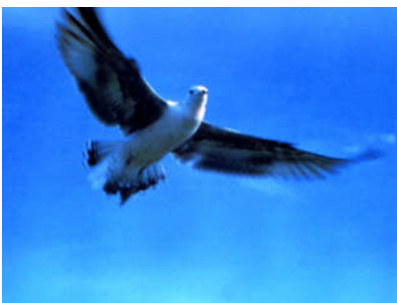
We are sanctified by the Holy Spirit.

Hebrews 10:16 This is the covenant that I will make with them after those days, says the LORD: I WILL PUT MY LAWS INTO THEIR HEARTS, AND IN THEIR MINDS I WILL WRITE THEM.