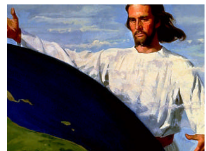
We love Jesus because He first loved us.

It is true that we are saved by faith in Christ, but it is false to think God saves us in our sin. Sin is breaking God's law. 1 John 3:4. Christ came to save us from our sins, not in them. Obedience is the sign of true discipleship. Instead of releasing us from obedience, it is faith, and faith only, that makes us partakers of the grace of Christ, which enables us to render obedience. Obedience then, is the fruit of faith.