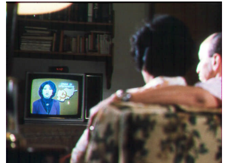
As God’s children we will seek more of God’s Word and less of the world’s words.

While it is true that the sanctified Christian will become more Christlike, and through Christ’s power in the life will forsake sin, it is nonetheless true that the sinful nature is still present. If we claim to be sinless, we are in grave error. The sinful nature, even though subdued, will remain until the second coming of Christ. The saved Christian will then find “redemption of the body” – the sinful nature gone – but not until then.