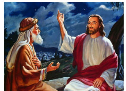
Nicodemus came at night to talk to Jesus but did not accept him openly for some time.

It is always a tragedy when we do not stand for our convictions because of what others may think. We need to pray for the courage not to be ashamed of Jesus. People did not stand up for Jesus in his time because of what religious leaders might say or think. Unfortunately it is often the same today. People are afraid of what relatives, friends or even religious leaders might think of them if they stand up for the truth. Again, Jesus and His truth must take first place.