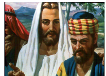
Rich Young Ruler.

Luke 12:19,20 And I will say to my soul, “Soul, YOU HAVE MANY GOODS LAID UP for many years; take your ease; eat, drink, and be merry.” But God said to him, “FOOL! THIS NIGHT YOUR SOUL WILL BE REQUIRED OF YOU; THEN whose will those things be which you have provided?”