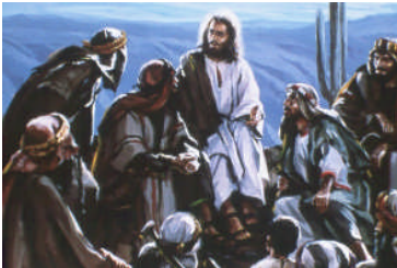
They forsook all for Jesus.

Then Peter answered and said to Him, “SEE, WE HAVE LEFT ALL AND FOLLOWED YOU. Therefore what shall we have?” So Jesus said to them, “Assuredly I say to you, that in the regeneration, when the Son of Man sits on the throne of His glory, you who have followed Me will also sit on twelve thrones, judging the twelve tribes of Israel. AND EVERYONE WHO HAS LEFT HOUSES OR BROTHERS OR SISTERS OR FATHER OR MOTHER OR WIFE OR CHILDREN OR LANDS, FOR MY NAME’S SAKE, SHALL RECEIVE A HUNDREDFOLD, AND INHERIT ETERNAL LIFE.”