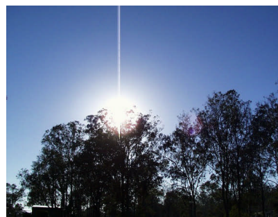
God sent a drought for 3 ½ years to show who sends the rain.

1 Kings 18:17,18 Then it happened, when Ahab saw Elijah, that Ahab said to him, “ Is that you, O troubler of Israel?” And he answered, “I have not troubled Israel, but you and your father’s house have , in that you have forsaken the commandments of the LORD and have followed the Baals.