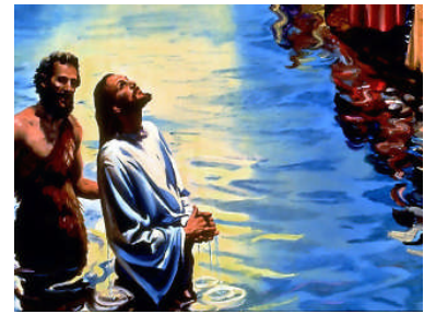
John the Baptist was referred to as a type of Elijah by Jesus.

What then is the significance of Malachi's prediction concerning the return of Elijah? The work of Elijah was to prepare a people to meet their God. The Bible reveals a repetition of the work of Elijah on two different occasions. The first message was to prepare a people to meet Jesus when He first came to the earth. The second message of preparation is to make a people ready for His second coming.