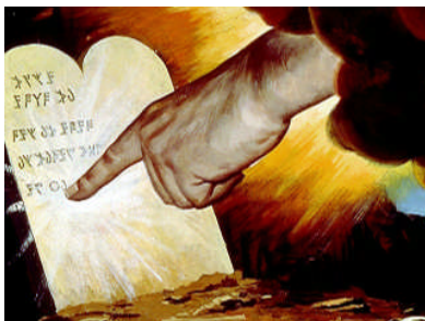
The Children of Israel had forgotten God's Law and were worshipping other false gods.

Matthew 11:10,11,14 For this is he of whom it is written: Behold, I send My messenger before Your face, who will prepare Your way before You. Assuredly, I say to you, among those born of women there has not risen one greater than John the Baptist; but he who is least in the kingdom of heaven is greater than he... "And if you are willing to receive it , he is Elijah who is to come."