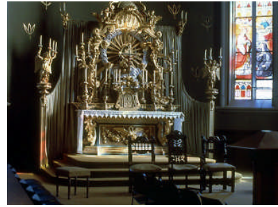
Paganism entered the Christian Church and the Law of God was once again forgotten.

This is the period of Papal supremacy between A.D. 538 to A.D. 1798 (1260 years). For more details see the chart 1260 Years of Papal Supremacy and the study on the True Church . This was a time of spiritual drought for the word of God, paralleling the literal drought of 3 ½ years in Elijah’s day.