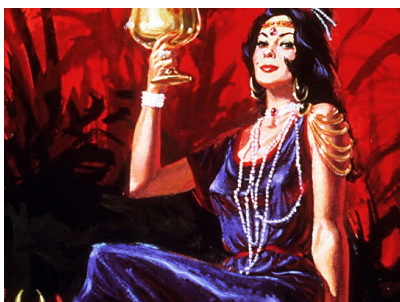
Queen Jezebel sought to kill Elijah for showing her religion to be false.

2 Kings 2:11 Then it happened, as they continued on and talked, that suddenly a chariot of fire appeared with horses of fire, and separated the two of them; and Elijah went up by a whirlwind into heaven.