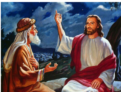
Jesus explaining to Nicodemus about the Holy Spirit.

Ephesians 4:30 And DO NOT GRIEVE THE HOLY SPIRIT OF GOD, by whom you were sealed for the day of redemption.