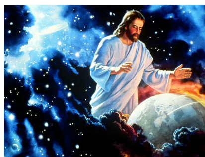
Christ has created all things.

The word firstborn means “first in rank”, and in the context of this chapter shows Christ as responsible for all creation. This places Him as first in rank. Verse 15 does not say He was created by God. Verse 18 gives Him the position of “first in rank” once again in reference to the resurrection. He was not first in “time”, but resurrections were only possible by virtue of Christ’s resurrection; or in this He was “first in rank”.