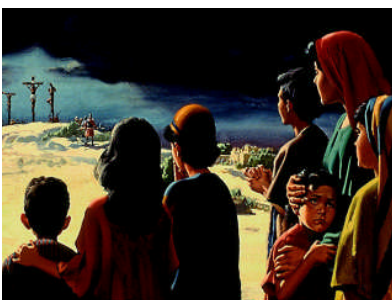
The Holy Spirit points us to Christ and reveals Christ to us.

The Holy Spirit also works toward our salvation.