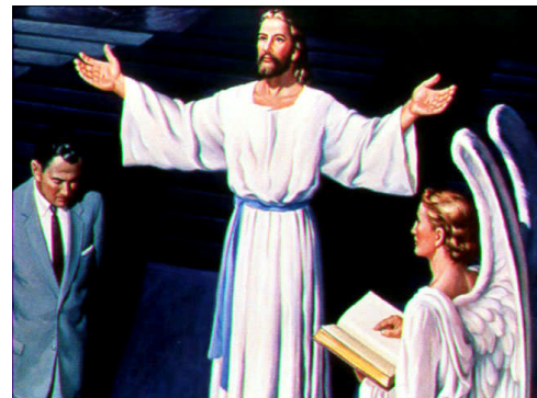
Christ – the God-man interceding for us.

Hebrews 1:5,6 For to which of the angels did He ever say: “You are My Son, Today I have begotten You”? And again: “I will be to Him a Father, And He shall be to Me a Son”? But when He again brings the FIRSTBORN into the world, He says: “Let all the angels of God worship Him.”