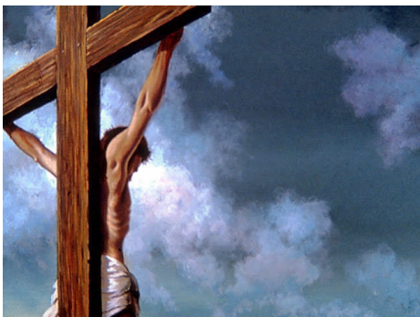
Jesus cut off in the midst of the 70 th week.

Daniel 9:26,27 AND AFTER THE SIXTY-TWO WEEKS MESSIAH SHALL BE CUT OFF, but not for Himself; and the people of the prince who is to come shall destroy the city and the sanctuary. The end of it shall be with a flood, and till the end of the war desolations are determined. Then HE SHALL CONFIRM A COVENANT WITH MANY FOR ONE WEEK; but IN THE MIDDLE OF THE WEEK HE SHALL BRING AN END TO SACRIFICE AND OFFERING. And on the wing of abominations shall be one who makes desolate, even until the consummation, which is determined, is poured out on the desolate.