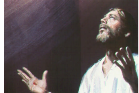
Daniel struggles to fully comprehend the vision but is unable. Before Gabriel finishes the explanation – Daniel faints and the explanation must be continued later in Daniel 9.

Gabriel was unable to continue explanations concerning the vision, because Daniel took sick. All the previous prophecies in the book of Daniel had been explained. The only one left unexplained was the 2,300-day prophecy.