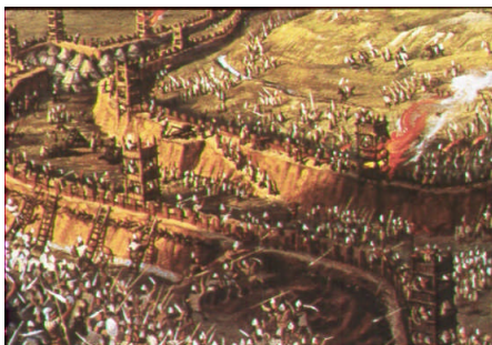
The Destruction of Jerusalem.

The martyrdom of Stephen. A far deeper significance is attached to the stoning of Stephen than may appear to the casual reader. It clinches the former rejection of the Gospel by responsible Jewish leaders at Jerusalem (Acts 7:51-54). It precipitates a new era in Gospel expansion. Exclusive labour for Jews abruptly ceases. Christian witnesses, scattered by the sudden outburst of savage persecution, are impelled to evangelise the Gentiles. Samaritans and the Ethiopian eunuch are the first-fruits from among non-Jews (Acts 8:1,4,5,27,29).