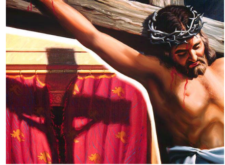
Veil torn when Jesus died.

No longer were animal sacrifices needed. The One great Sacrifice, Jesus, was the One all other sacrifices pointed to. He caused the sacrificial system to cease.