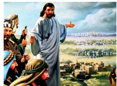
Jesus said in Matt 24:15 that understanding Daniel would be important for the future.

In Daniel Chapter 8 is an interesting prophecy outlining the rise and fall of earthly powers. These are described in more detail in Chapters 2 and 7. In this chapter emphasis is given to the 'little horn' power, which "waxed exceeding great", and brought persecution to God's people. This is explained more fully in another study.