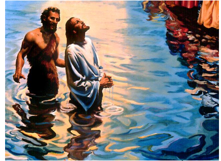
The Baptism of Jesus begins the 70 th week.

The 7 weeks and 62 weeks equal 483 prophetic days or 483 years. This means, counting ahead 483 years from 457 B.C. we are brought to the time of the Messiah, i.e. Jesus Christ. The date comes to 27 A.D.