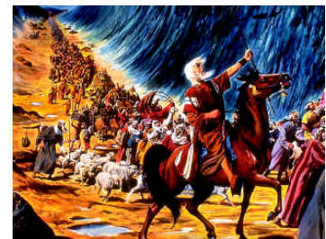
God's chosen people.

The children of Israel who came out of Egypt were God's chosen people. They received the oracles of God; to them the promises were made when God entered into a covenant relationship with them. But God planned that His people should enter into a better covenant relationship with Him. The basis of the new covenant was not written on tables of stone (the 10 commandments), but the same law was written on the heart. The old covenant was given to literal Israel, but the new covenant to spiritual Israel. Even before the cross men were saved by virtue of the promises of the New Covenant that were ratified by the blood of Christ at Calvary. God's true people – spiritual Israelites – were always those who loved God enough to obey Him. His law was written in their hearts. Their religion was not an outward show, but an inward experience by the power of God, which manifested itself in righteous living.