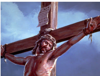
Everyone becomes part of the family through the blood of Christ.

Christ is the Mediator of the New Testament (covenant) by means of His sacrifice. The forgiveness of sins through His blood made it possible for us to enter into a saving relationship with Him. Through the cross we became part of His family.