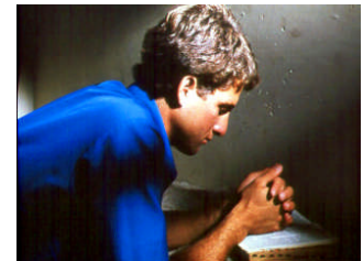
We should pray to receive the Holy Spirit.

King David had grieved the Holy Spirit by his sin, but under conviction he repented, and pleaded with God that the Holy Spirit not be taken away.