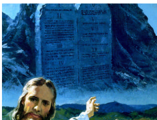
The Holy Spirit is manifested in keeping God's Commandments.

Galatians 5:22,23 BUT THE FRUIT OF THE SPIRIT IS LOVE, JOY, PEACE, LONGSUFFERING, KINDNESS, GOODNESS, FAITHFULNESS, GENTLENESS, SELF-CONTROL. Against such there is no law.