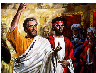
Peter preaching powerfully by the Holy Spirit.

Acts 2:17,18 AND IT SHALL COME TO PASS IN THE LAST DAYS, SAYS GOD, THAT I WILL POUR OUT OF MY SPIRIT ON ALL FLESH; your sons and your daughters shall prophesy, your young men shall see visions, your old men shall dream dreams. And on My menservants and on My maidservants I will pour out My Spirit in those days; and they shall prophesy.