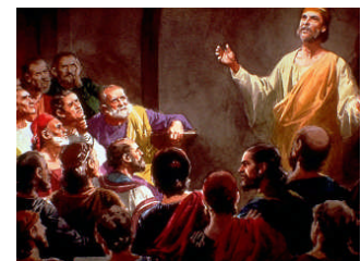
Holy Spirit falls on disciples.

The word convict used here is very appropriate. The Holy Spirit does convict the hearts of people. This was evident on the day of Pentecost where it is written, “they were cut to the heart.” Acts 2:37. Not only does the Holy Spirit convict of sin, but also of righteousness. He urges people to accept the righteousness of Christ. Then He points to the judgement to awaken sin-darkened minds from their apathy. Thus the Holy Spirit convicts people of their sin, points them to Jesus and warns them of the consequences if they continue in their sin.