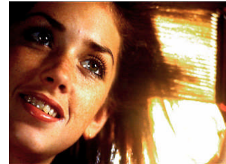
Holy Spirit brings joy and peace and transforms the life.

Galatians 3:14 That the blessing of Abraham might come upon the Gentiles in Christ Jesus, THAT WE MIGHT RECEIVE THE PROMISE OF THE SPIRIT THROUGH FAITH.