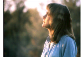
The Spirit draws us close to God.

Galatians 5:16 I say then: WALK IN THE SPIRIT, and you shall not fulfil the lust of the flesh.