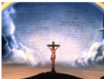
Grace gives us righteousness to keep the law because we can't without it.

Some believe that the Old Covenant was the moral law, or the Ten Commandments, and that when the new covenant was ratified, the law was annulled or set aside. But the Old Covenant was not the 10 commandment law. Instead, it was an agreement made between God and the people. True, the commandments were the basis of the covenant but they were not the covenant. The law was only the subject.