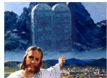
The new covenant writes God's law on our hearts.

The Old Covenant was an agreement God made with Israel to demonstrate to them their weakness and their entire dependence upon Christ for power to keep God's law. They promised to obey, and meant it, but discovered that