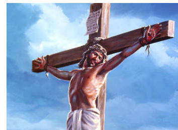
The New Covenant had always existed, both before and after the cross.

The New Covenant and the Everlasting Covenant are the same. No person living in Old Testament times was saved by virtue of the Old Covenant. Salvation was dependent upon the New Covenant which was really in effect before the foundation of the world. “The Lamb slain from the foundation of the world”. Rev 13:8.