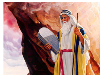
Ten Commandments written on stone.

Exodus 19:5-8 “ ‘Now therefore, IF YOU WILL INDEED OBEY MY VOICE AND KEEP MY COVENANT , then you shall be a special treasure to Me above all people; for all the earth is Mine. And you shall be to Me a kingdom of priests and a holy nation.’ These are the words which you shall speak to the children of Israel.” So Moses came and called for the elders of the people, and laid before them all these words which the LORD commanded him. Then all the people answered together and said, “ ALL THAT THE LORD HAS SPOKEN WE WILL DO. ” So Moses brought back the words of the people to the LORD.