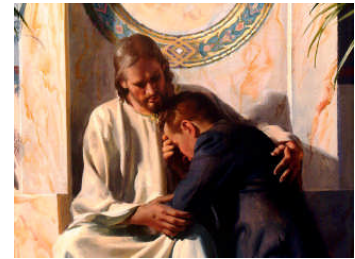
I can do all things through Christ.

2 Corinthians 3:3 Clearly you are an epistle of Christ, ministered by us, written not with ink but by the Spirit of the living God, NOT ON TABLETS OF STONE BUT ON TABLETS OF FLESH, THAT IS , OF THE HEART.