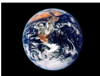
The power to live the Christian life comes from God, not us. It is the same power that made the world.

Those who are under the Everlasting Covenant will receive the promises. Their sins are forgiven, their prayers are heard, they have Christ's righteousness, they will be raised to life eternal, they will live in the Promised Land – Paradise, and Christ will dwell with them forever. The covenant of promise was given to Adam and Eve, to Abraham and to the children of Israel as it was taught through the sacrificial services. All men and women throughout history find salvation only by the New or Everlasting Covenant. Only Christ's blood can atone for sin.