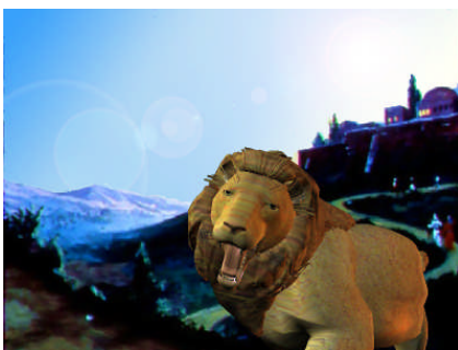
A lion tore and killed the prophet that disobeyed God's word.

...and he cried out to the man of God who came from Judah, saying, "Thus says the LORD: 'BECAUSE YOU HAVE DISOBEYED THE WORD OF THE LORD, and have not kept the commandment which the LORD your God commanded you, but you came back, ate bread, and drank water in the place of which the LORD said to you, "Eat no bread and drink no water," your corpse shall not come to the tomb of your fathers.' " When he was gone, a lion met him on the road and killed him. And his corpse was thrown on the road, and the donkey stood by it. The lion also stood by the corpse. Now