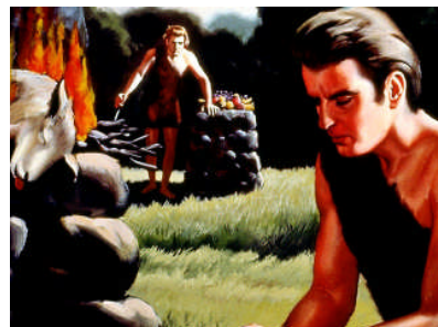
Cain and Abel offering their sacrifices.

Cain was trying to buy God's favour by good works, but forgiveness is only possible through the blood.