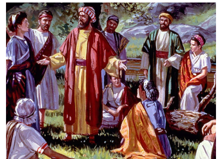
Ananias and Sapphira lied to the Holy Spirit and paid with their lives.

But a certain man named Ananias, with Sapphira his wife, sold a possession. And he kept back part of the proceeds, his wife also being aware of it , and brought a certain part and laid it at the apostles' feet. But Peter said, “Ananias, why has Satan filled your heart to LIE TO THE HOLY SPIRIT AND KEEP BACK PART OF THE PRICE OF THE LAND FOR YOURSELF? While it remained, was it not your own? And after it was sold, was it not in your own control? Why have you conceived this thing in your heart? You have not lied to men but to God.” THEN ANANIAS, HEARING THESE WORDS, FELL DOWN AND BREATHED HIS LAST. So great fear came upon all those who heard these things.