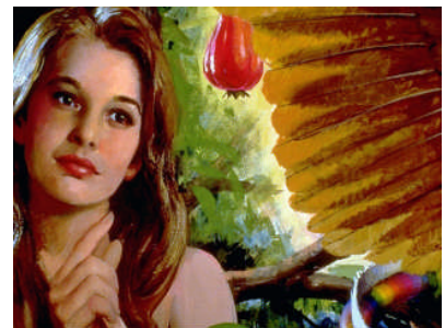
When Eve took the fruit, it was her death sentence!

Even though Eve was deceived, she was nevertheless guilty. Her act was inexcusable, for she had chosen to believe Satan speaking through the serpent, rather than God. Adam’s sin was perhaps worse, because of the fact that he was not deceived, yet he deliberately chose disobedience to the command of God. He was prepared to share his wife’s fate because of his deep love for her. Little did the first pair realize to what devastating results their disobedience would lead.