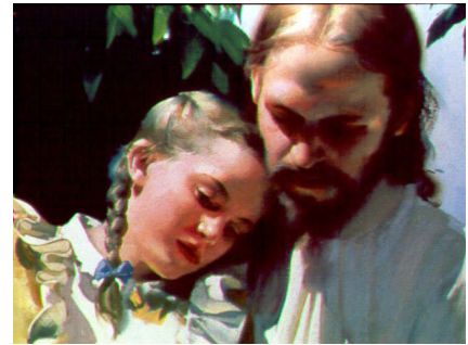
God loves us dearly but we must take Him seriously that He knows best.

Why is God so particular? He wants us to prepare for eternal life, and He knows that if we follow our own way we will be lost. The only way to the kingdom is on the straight and narrow way. Jesus is the door to this path, made possible through Calvary. While ever we trust in Him, and do His will, we are safe and we will gain eternal life at last. God is particular. Let us determine to be particular and never deviate from the path of righteousness.