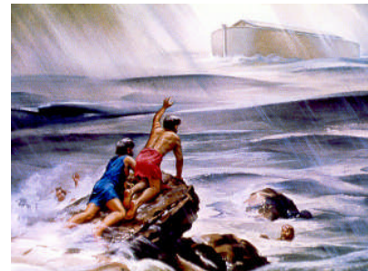
Those who rejected God by refusing to enter the ark, perished in the flood.

There are some who trample underfoot God's holy Sabbath day. "It doesn't matter which day you keep, as long as you keep one day in seven" they say. What does the commandment say? "Remember the Sabbath day to keep it holy". God has commanded that we remember the Sabbath and not any other day. He further says, "The seventh day is the Sabbath." No other day is said to be the Sabbath. Will we obey or not? Will we say that it doesn't matter? Is God particular or not? Disobedience to this command, to those who are enlightened, will ultimately result in the same fate as Adam and Eve, the people who did not go into Noah's ark, or Uzzah.