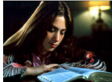
The value of a woman who loves God is above rubies.

Proverbs 31:30 Charm is deceitful and BEAUTY IS PASSING, but a woman who fears the LORD, she shall be praised.