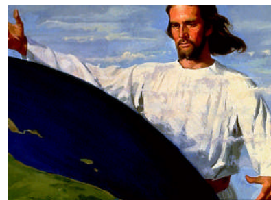
God is love.

1 Corinthians 13:4,5 LOVE suffers long and is kind; LOVE does not envy; LOVE does not parade itself, is not puffed up; does not behave rudely, DOES NOT SEEK ITS OWN, is not provoked, thinks no evil.