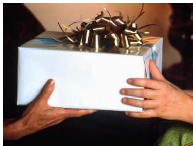
Love unexpressed dies – speak and show your love.

One vital factor in marriage is to express love. If a husband loves his wife he should tell her. He can commend her for her cooking (if he can do so with a clear conscience), her housework, and her dress. If he praises her (not flatters) she will bloom. The wife can express her love to her husband in kind loving words. But remember LOVE UNEXPRESSED DIES .