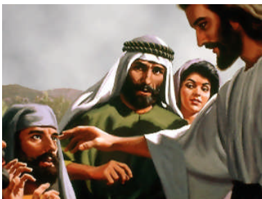
We should serve one another as Jesus serves us.

True marriage will bring the closest of relationships. The home of a happy Christian couple can be a haven for them in this world. Marriage can indeed be one of the greatest adventures in life.