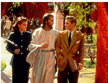
A couple united in Christ lays the strongest foundation.

Genesis 27:46; 28:1 And Rebekah said to Isaac, “I am weary of my life because of the daughters of Heth; if Jacob takes a wife of the daughters of Heth, like these who are the daughters of the land, what good will my life be to me?” Then Isaac called Jacob and blessed him, and charged him, and said to him: “YOU SHALL NOT TAKE A WIFE FROM THE DAUGHTERS OF CANAAN.”