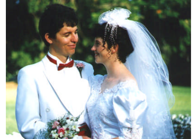
Marriage is for life.

The Pharisees also came to Him, testing Him, and saying to Him, “Is it lawful for a man to divorce his wife for just any reason?” And He answered and said to them, “Have you not read that He who made them at the beginning ‘made them male and female,’ and said, ‘For this reason a man shall leave his father and mother and be joined to his wife, and the two shall become one flesh’? So then, they are no longer two but one flesh. Therefore what God has joined together, let not man separate.” They said to Him, “Why then did Moses command to give a certificate of divorce, and to put her away?” He said to them, “Moses, because of the hardness of your hearts, permitted you to divorce your wives, but from the beginning it was not so. And I say to you, WHOEVER DIVORCES HIS WIFE, EXCEPT FOR SEXUAL IMMORALITY, AND MARRIES ANOTHER, COMMITS ADULTERY; and whoever marries her who is divorced commits adultery. ”