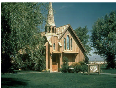
Judgment involves professed Christians only.

Here we notice a special message from God sounding forth – the hour of His judgment HAS COME – not coming. Early Bible writers spoke of judgment TO COME (Acts 24:25) but here is a special message that judgment is here. The INVESTIGATIVE JUDGMENT commences at the conclusion of the 2300 years – 1844, which is the cleansing of the heavenly sanctuary (Heb. 8:1,2). The Day of Atonement for the Jews was a day of judgment. 1844 commenced the judgment in heaven – similar in principle to a judgment in a court of law. The “EXECUTIVE JUDGMENT”, when sinners are destroyed, takes place at the end of the world. This can be paralleled to a man facing the death sentence for his crime. He has been tried, (investigation), found guilty, (sentenced) and put to death (punishment).