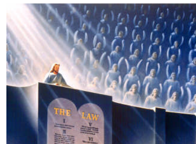
Jesus begins the judgment.

The Son of man (i.e. Jesus Christ) is also present at the judgment. He is not there to condemn, but he is an intercessor or lawyer on the believer's part. “And if anyone sins we have an advocate with the Father, Jesus Christ the righteous” (1 John 2:1).