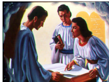
During the 1000 years the righteous will judge angels and men who rejected Christ.

For if God did not spare THE ANGELS WHO SINNED, but cast them down to hell and delivered them into chains of darkness, to be RESERVED FOR JUDGMENT; then the Lord knows how to deliver the godly out of temptations and to RESERVE THE UNJUST UNDER PUNISHMENT FOR THE DAY OF JUDGMENT.