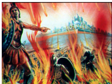
Wicked executed at the end of the millennium.

In judging the wicked, the saints (i.e. believers in Christ) will sit upon thrones to share with Jesus His authority and power to judge and execute judgment. The righteous ascend with Christ at His Second Coming (see 1 Thessalonians 4:16,17) but the wicked are not raised for judgment until the end of the 1000 years. (See Rev 20:5). During the 1000 years the saints sit in judgment. (See Rev 20:4). These points are explained in detail in the Bible Study on “The Millennium”.