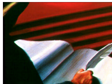
All names written in the Book of Life come up for review.

All names which have been written in the book of life, (i.e. any person who at any time professed to follow Jesus) will have their names come up for review before the heavenly tribunal. Every name is called, and every name closely investigated. When the judgment of the dead is completed, the judgment of the living will commence and each case will be sealed either at death or at the close of human probation, whichever comes first.