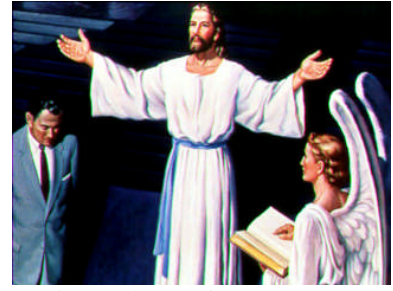
Praise God Jesus is our Advocate.

My little children, these things I write to you, so that you may not sin. And if anyone sins, WE HAVE AN ADVOCATE WITH THE FATHER, JESUS CHRIST the righteous.