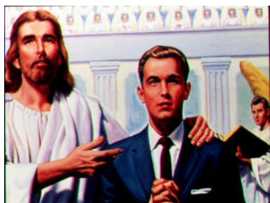
Only those holding tightly to Christ's righteousness will pass the judgment.

Acts 17:31 ...because HE HAS APPOINTED A DAY ON WHICH HE WILL JUDGE THE WORLD in righteousness by the Man whom He has ordained. He has given assurance of this to all by raising Him from the dead.