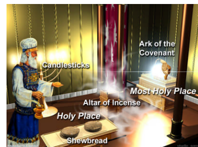
The cleansing of the Hebrew sanctuary was a symbol of the judgment that commenced in 1844.

The reason for using the term “cleansing of the sanctuary” is understood more clearly when we understand the meaning of the Old Testament sanctuary and its services. There were daily sacrifices for sins, but once each year they celebrated the “DAY OF ATONEMENT.”