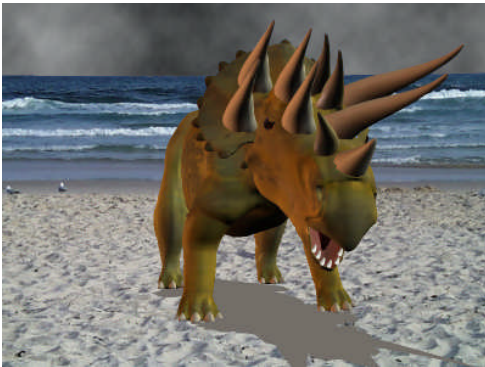
The fourth beast represents Rome.

I was considering the horns, and THERE WAS ANOTHER HORN, A LITTLE ONE, COMING UP AMONG THEM, before whom THREE OF THE FIRST HORNS WERE PLUCKED OUT BY THE ROOTS. And there, in this horn, were eyes like the eyes of a man, and A MOUTH SPEAKING POMPOUS WORDS. Then I wished to know the truth about the fourth beast, which was different from all the others, exceedingly dreadful, with its teeth of iron and its nails of bronze, which devoured, broke in pieces, and trampled the residue with its feet; and the ten horns that were on its head, and the other horn which came up, before which three fell, namely, that horn which had eyes and a mouth which spoke pompous words, whose APPEARANCE WAS GREATER THAN HIS FELLOWS.