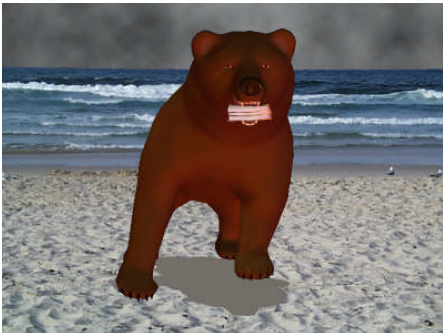
The bear represents Medo Persia.

Daniel 7:5 And suddenly another beast, A SECOND, LIKE A BEAR. It was raised up on one side, and had three ribs in its mouth between its teeth. And they said thus to it: “Arise, devour much flesh!”