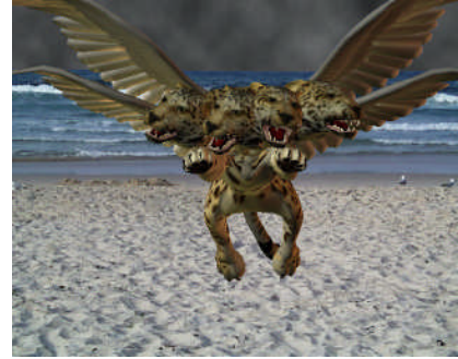
The leopard representing Greece.

The dreadful beast very fittingly represented the fourth successive world empire and that was Pagan Rome. The iron teeth parallel with the iron legs of the image in Daniel 2:40. The ten horns of this fourth beast pictured the break up of power of Pagan Rome into the divisions of Western Europe, which were finally established by the year A.D. 476. This corresponds with the feet and toes of Daniel 2:41-43.