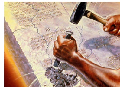
Satan hates God's law.

Revelation 17:15 Then he said to me, " THE WATERS WHICH YOU SAW, where the harlot sits, ARE PEOPLES, MULTITUDES, NATIONS, AND TONGUES. "