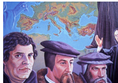
Reformers like Luther, Tyndale & Calvin identified the Papacy as the Antichrist.

Up till the Revolution, France had been a leading supporter of the Papacy for many centuries, and was called “The Eldest Son of the Church”. Consequently this disaster brought to an end the age-long political supremacy of the bishop of Rome, and dealt the Papacy a wound from which it has not yet fully recovered.