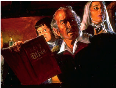
The Bible was forbidden to be read by laymen during the dark ages.

“SPEAK POMPOUS WORDS AGAINST THE MOST HIGH.” The Papacy has done this. e.g. The Catholic National , July 1895. “The Pope is not only the representative of Jesus Christ, but He is Jesus Christ Himself, hidden under the veil of flesh.”