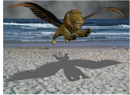
The lion represents Babylon.

Daniel 7:4 The first was like a LION, AND HAD EAGLE’S WINGS. I watched till its wings were plucked off; and it was lifted up from the earth and made to stand on two feet like a man, and a man’s heart was given to it.