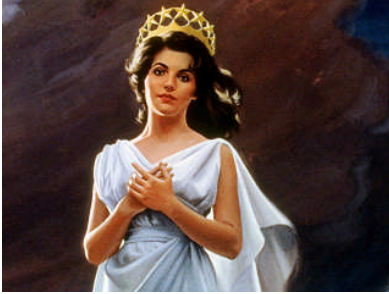
Christ's Bride – the church will always cling to the commandments of God and the faith of Jesus.

world bows down in a reverent obedience to the command of the holy Catholic Church”. (Many other quotations could be given by both Protestant and Catholic authors but space does not permit