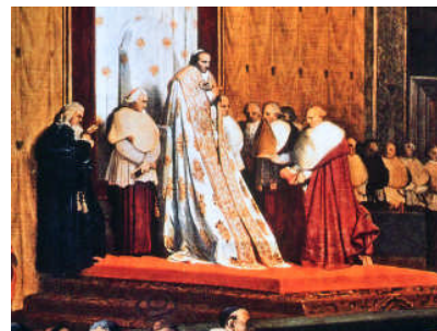
The Papacy is the Little Horn of Daniel Eight.

Rome and Rome only fits this historical picture. Without doubt it is the “little horn” of Daniel 8.