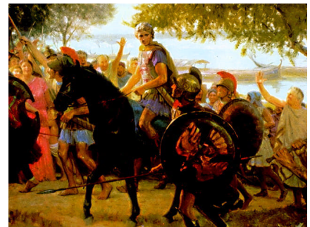
Large horn on Goat symbolized Alexander the Great.

Here is emphasized the sudden fall of Alexander. He was the large horn that was broken. This mighty warrior died at the age of thirty-three, partly because of his overexertions in conquering the world, and partly from a fever caused by his intemperate living. After a drunken debauch he was seized with a violent fever and died eleven days later, June 13, 323 B.C. Before he died he was asked who should rule the kingdom. His reply was “let it go to the strongest!” Alexander’s brother and two infant sons were declared rulers of the empire, but they were soon murdered and the family of Alexander became extinct. Thus there were twenty years of strife between the generals of Alexander as they struggled for the supremacy. Ultimately the empire was divided into four kingdoms, paralleling the four notable horns. Macedonia was ruled by Cassander, Thrace and Asia Minor by Lysimachus, Syria by Seleucus and Egypt by Ptolemy.