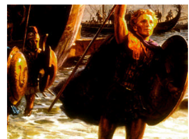
The Goat symbolized the conquest of Greece.

And as I was considering, suddenly A MALE GOAT CAME FROM THE WEST, across the surface of the whole earth, without touching the ground; and the goat had a NOTABLE HORN BETWEEN HIS EYES. Then he came to the ram that had two horns, which I had seen standing beside the river, and ran at him with furious power. And I SAW HIM CONFRONTING THE RAM; he was moved with rage against him, ATTACKED THE RAM, AND BROKE HIS TWO HORNS. There was no power in the ram to withstand him, but he cast him down to the ground and trampled him; and there was no one that could deliver the ram from his hand.