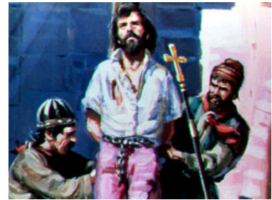
As in the Dark Ages, this persecuting power will persecute God's people again.

Daniel 8:23-25 And in the latter time of their kingdom, when the transgressors have reached their fullness, A KING SHALL ARISE, HAVING FIERCE FEATURES, WHO UNDERSTANDS SINISTER SCHEMES. HIS POWER SHALL BE MIGHTY, but not by his own power; he shall destroy fearfully, and shall prosper and thrive; HE SHALL DESTROY THE MIGHTY, AND ALSO THE HOLY PEOPLE. Through his cunning he shall cause deceit to prosper under his rule; and he shall exalt himself in his heart. He shall destroy many in their prosperity. HE SHALL EVEN RISE AGAINST THE PRINCE OF PRINCES; but he shall be broken without human means.