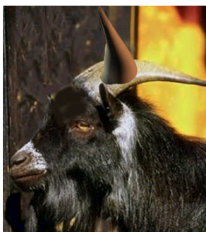
A little horn arose out of one of the four horns.

Some have mistaken the little horn to be Antiochus Epiphanes, king of Syria who was a great enemy and persecutor of the Jews. But as we will see, it cannot be so, because he does not fit into the details of the prophecy.