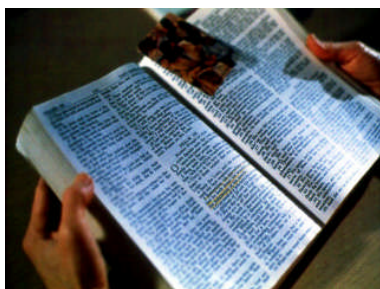
Speaking in ecstatic utterances does not agree with the Scripture.

Many of these tapes have been submitted to various “tongues interpreters” but it was found that each interpreter had a different interpretation for the same message. Under close investigation truth always shines, but here we see an exposure of error. Ecstatic tongues have failed the test. They are the counterfeit of the true Bible gift. What a pity that so many who are looking for something in life fall into the trap of emotionalism – a deceptive substitute for faith. People are depending on a feeling – an experience – rather than a “Thus saith the Lord”.