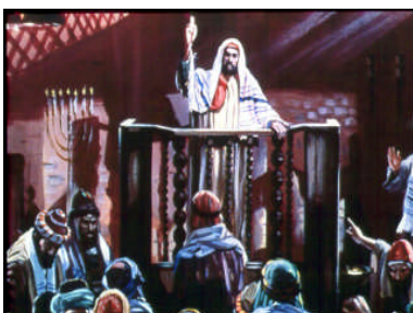
The Corinthians were misusing the gift of tongues.

Read the whole chapter. In this study we will refer to the main texts only.