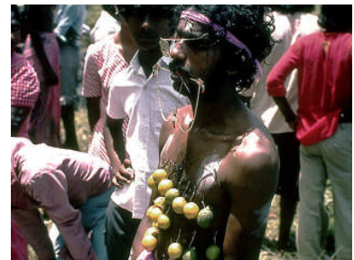
Tongues speaking originated in paganism, NOT Christianity.

Speaking in tongues goes back as far as 1100 B.C. when a young Amon worshipper was said to be possessed of a god and began to emit sounds in a strange ecstatic "tongue." Seven hundred years later, the Greek philosopher Plato made mention of the 'gift' in his time. He referred to several families who practised the ecstatic speech. He further pointed out that these practises also brought about physical healing. In the last century before Christ, Virgil, the Sybilline priestess on the Island of Delos, attributed her ecstatic tongues to the result of her being unified with the god Apollo. Members of the Hare Krishna movement report an ecstatic experience through repetitiously chanting the name of their god. Yogi Maharishi Mahesh taught the Beatles the way to 'serenity, joyfulness and the expansion of consciousness' by the repetition of one word – (WHICH MUST BE MEANINGLESS).