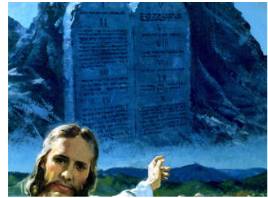
The Holy Spirit is given to those who obey God and keep His commandments.

How do we receive the Holy Spirit? Galatians 3:14 says, “That we might receive the promise of the Spirit through faith ”. When we believe – when we accept Jesus as our Saviour – when we are converted – we receive the Holy Spirit. Also, the Holy Spirit is given only to those who obey God and keep His commandments (Acts 5:32).