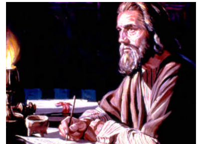
Paul rebukes Corinth for their falling away.

These tongues were real languages, because Peter, in recounting the incident testifies, “the Holy Spirit fell upon them, as upon us at the beginning ” verse 15; and also, “God gave them the same gift as He gave us ” verse 17. The gift of tongues at Pentecost was real foreign languages and now the Gentiles were given the same gift. In Acts 19:1-7 the same word for “tongues” is used as in Acts 2 and Acts 10, making it obvious that the gift of foreign languages is evident all the way through and in no way is referring to a different kind of tongues speaking.